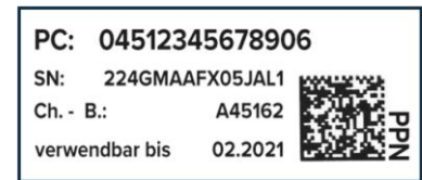
LABELS FOR PACKAGINGS